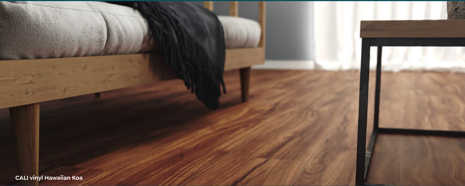
CALI vinyl Hawaiian Koa