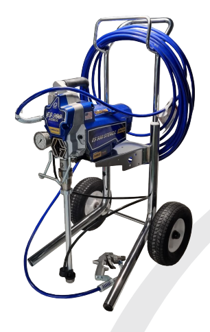
ES 500 STENCIL HI-BOY