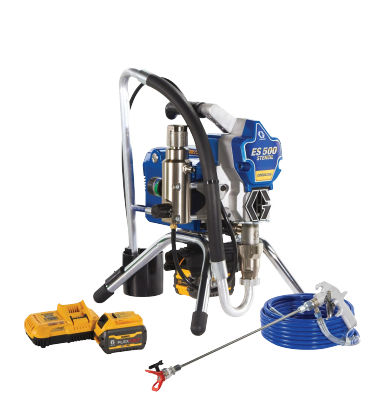
ES 500 STENCIL