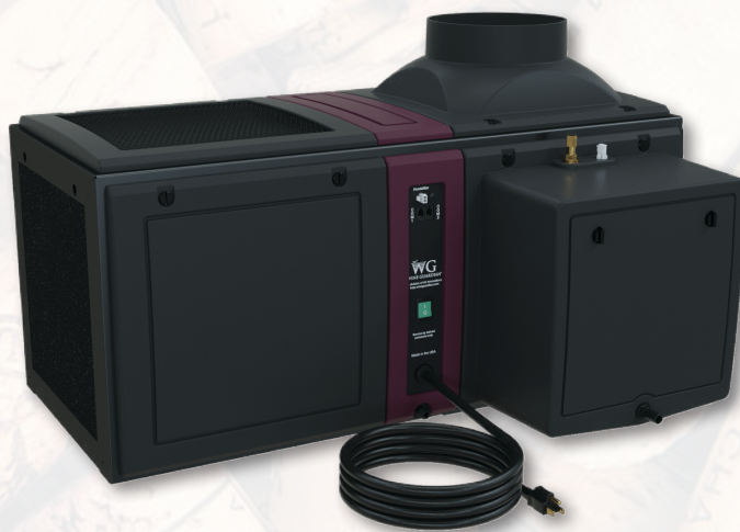
Integrated Humidifier attached onto a Sentinel Series Ducted system.