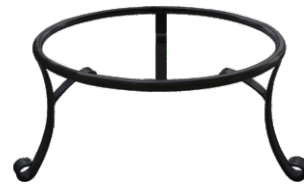
Part B Qty.1 STAND