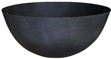
Part A Qty.1 FIRE BOWL