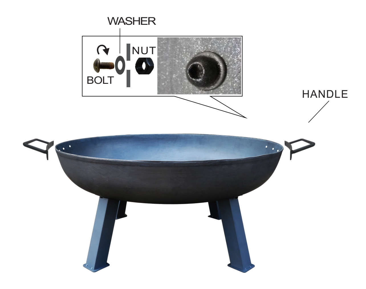
Step 2: Fix the handles onto the fire bowl with bolts nuts and washers.