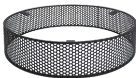
Part B Qty.1 BASE