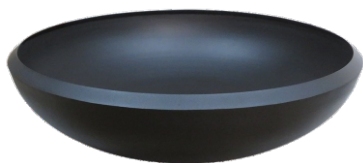
Part A Qty.1 FIRE BOWL