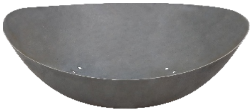
Part A Qty. 1 FIRE BOWL