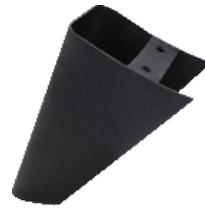
Part B Qty. 3 LEG