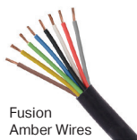
Fusion Amber Wires