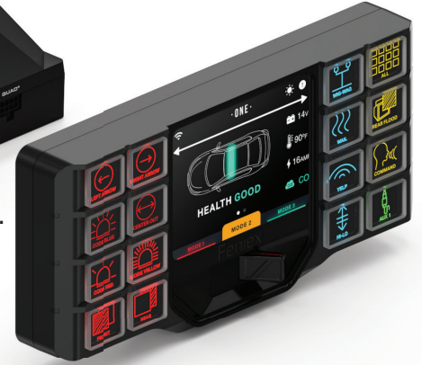
A. Feniex one Controller B. Feniex One Relay