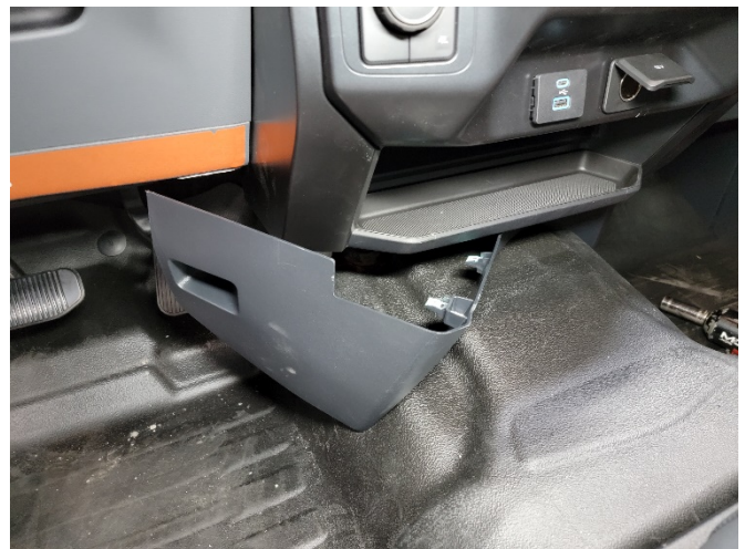
Remove lower trim