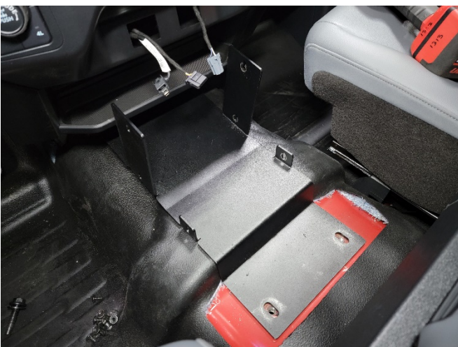
Place base mounting bracket in vehicle and line up to holes in floor.