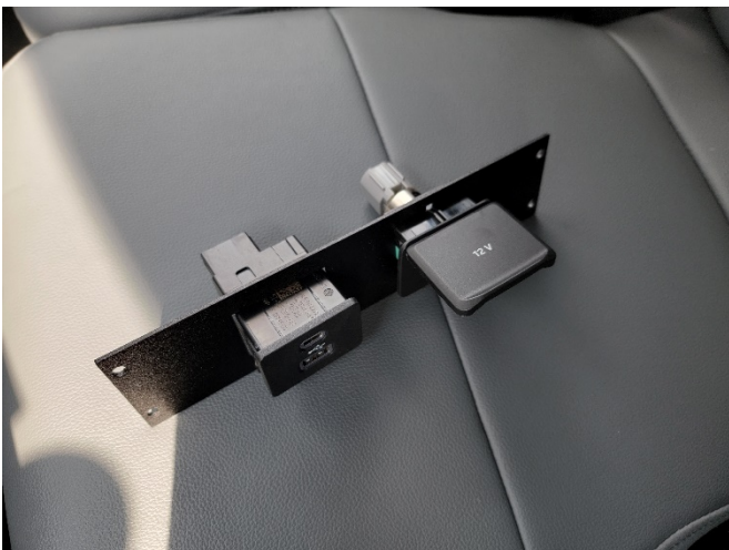
Snap USB and 12v socket into plate