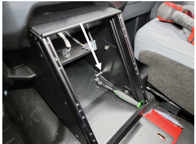
Slide console in over main mounting bracket and install using (6) 1/4" x 3/4" carriage bolts and serrated nuts.