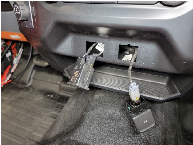
Unplug and remove from dash