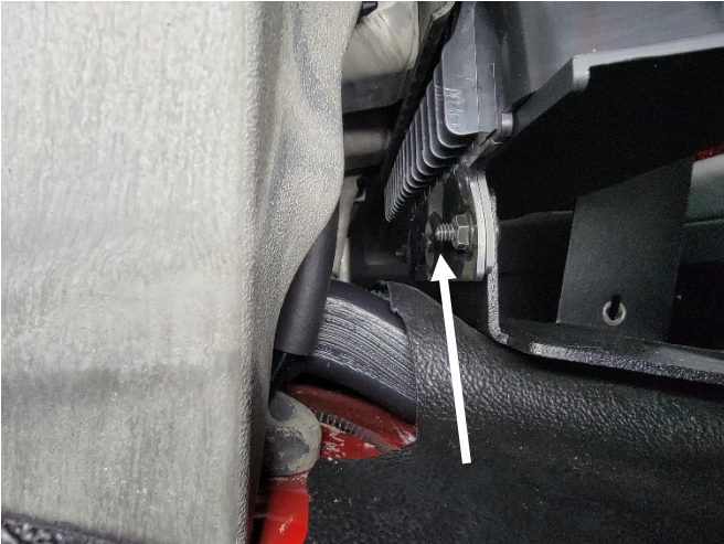
Install 1/4" serrated nuts onto the previously installed carriage bolts and tighten.