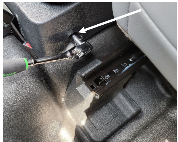
Remove bolts from front, sides of middle seat