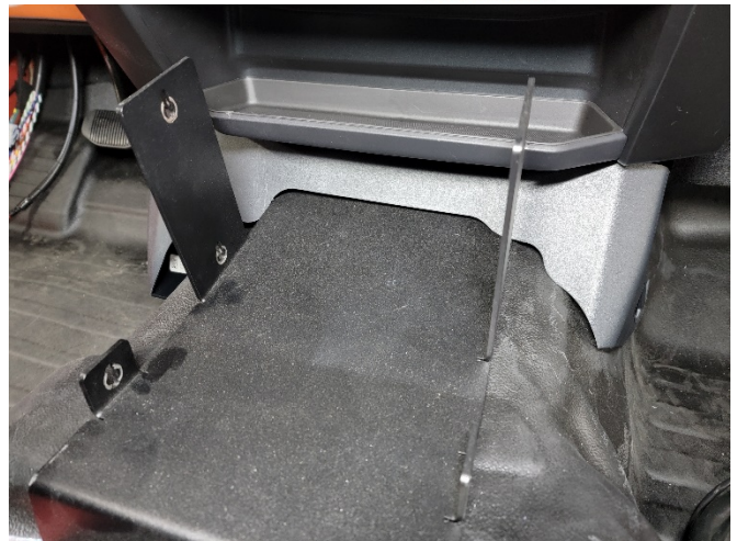
Place the lower dash trim into place, mark around mounting base and trim as needed to reinstall.