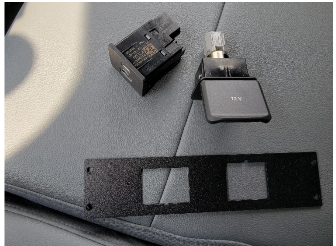
View of USB relocation plate