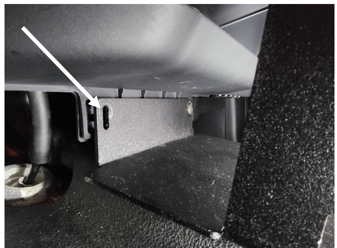
Install (2) 1/4" x 1/2" carriage bolts through the front of the bracket through the lower dash slots.