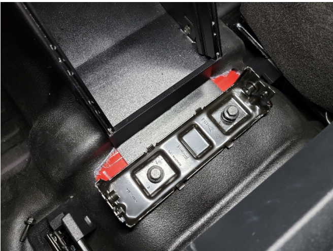
Reinstall previously removed OEM floor mounting bracket and torque to manufacturer's specifications.