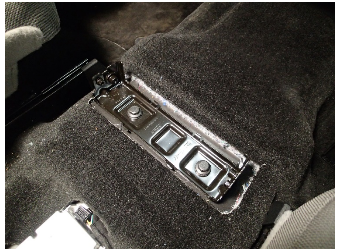
Unbolt forward, floor-mounting bracket