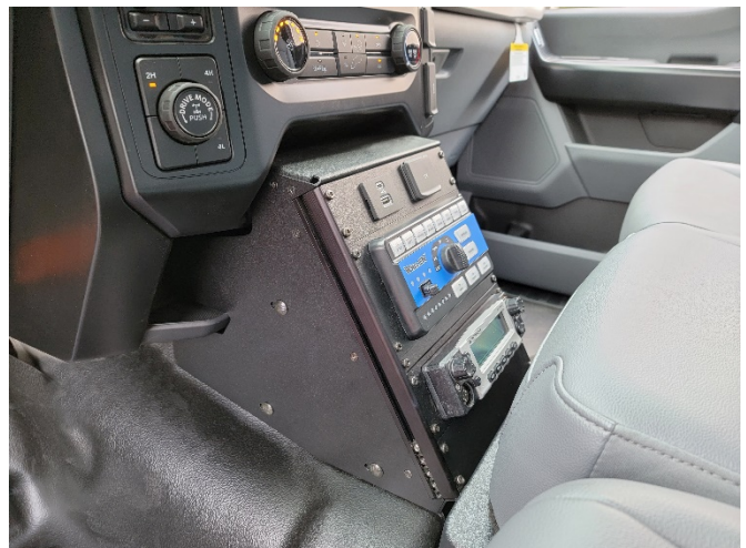
Installation is now complete.