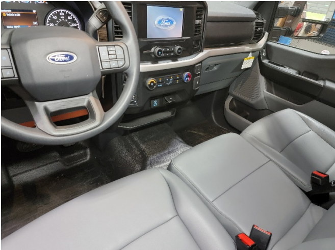
View of F-150 interior prior to install