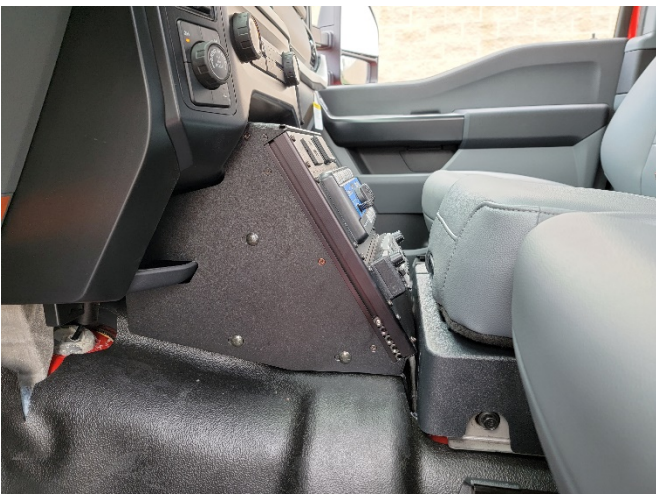
Wire, mount and install equipment prior to reinstalling OEM center seat.