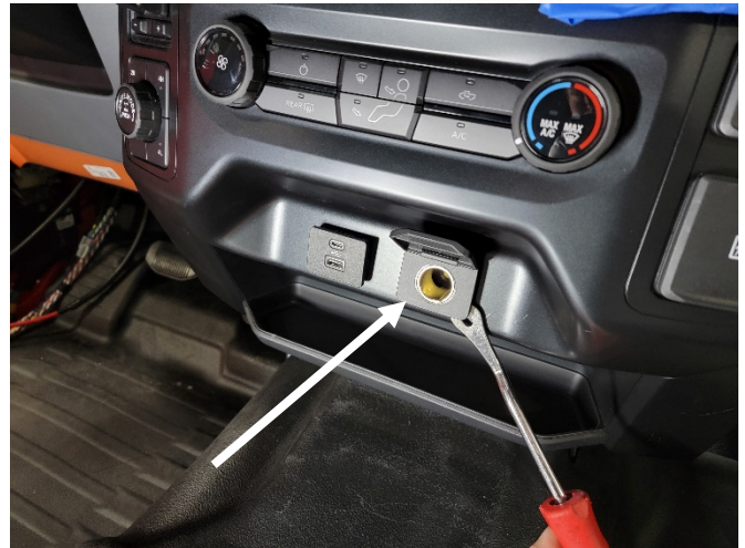
Remove OEM 12v socket and USB plate