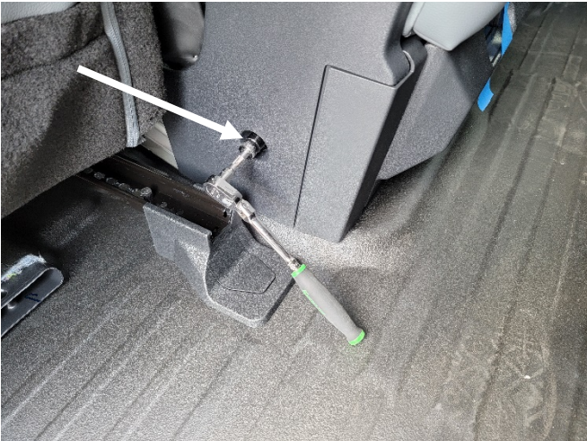
Remove bolts from rear, sides of middle seat.