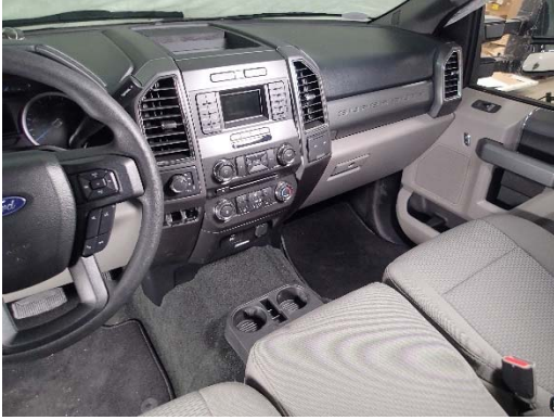
Model XLT dashboard before installation.

Note: Model XLT has optional CD player and model XL does not. CM008674 Filler plate is provided for XL application.