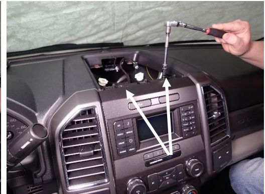
Remove two (2) 7mm head fasteners from top of radio and HVAC controller