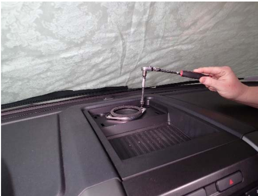
Remove two (2) 7mm head fasteners located next to the center channel speaker.