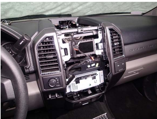
Starting at the top, gently pry along the radio and HVAC controller and remove.