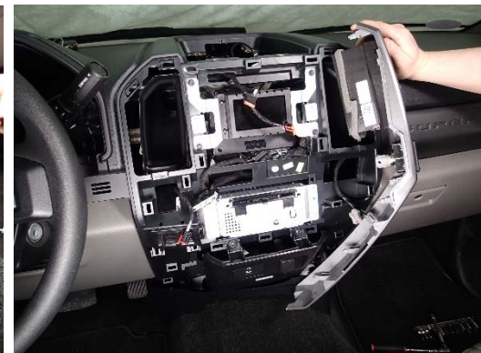
Gently pry along the side vent panels around the previously removed trim bezels starting at the top and working your way down.

It is not necessary to fully remove this panel.