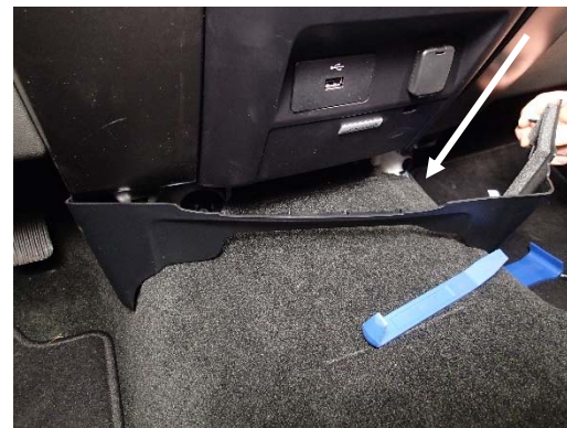
Unclip the lower trim panel from the lower portion of the dash. Pull to the side.

It is not necessary to fully remove this panel.