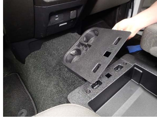
Flip up center seat and remove OEM cup holder.

Note: Model XLT has optional CD player and model XL does not. CM008674 Filler plate is provided for XL application.