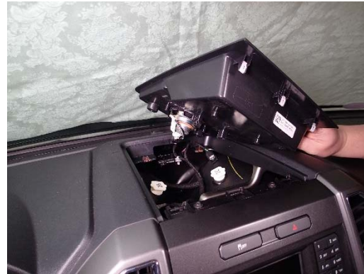
Pop up upper storage tray and unplug speaker.