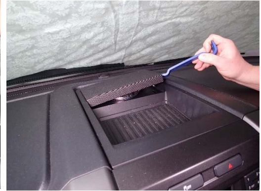
Gently pry up speaker cover If your vehicle does not have the speaker simply lift the rubber mat to expose the fasteners.