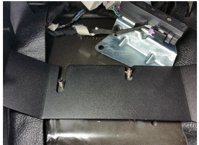
Make sure the ignition key sense module is moved out of the way and line up the U bracket to the OEM studs.