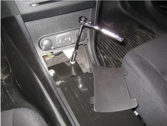
Remove forward O.E.M console plastic cover and remove two (2) nuts from front floor bracket. Nuts to be reused later. (10mm)