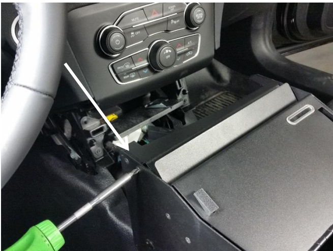
Attach the front printer trim panel (12593) using four (4) #8-18 x 1/4" flat head screws. (16425)