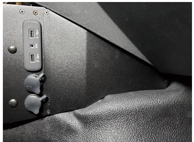
Attach passenger side trim panel on with # 8 x 1/4 Flat head screws. (included with hardware kit)