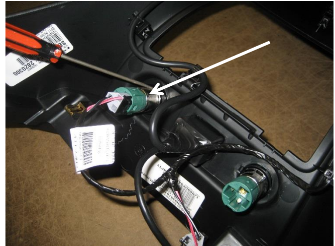
Remove OEM lighter plugs and AUX panel from factory center console. Plug O.E.M. wire harness back onto original connectors.