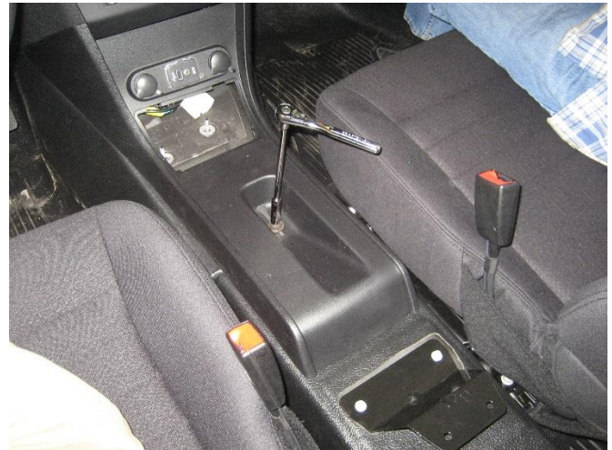
Remove bolts that hold underside of extrusion to rear floor bracket. (7/16 wrench) Remove rear floor bracket bolts and center console bolt. (10mm)