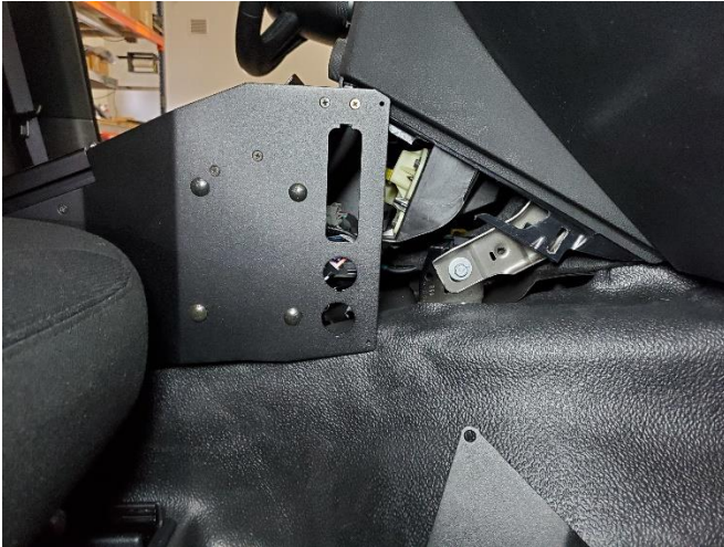
Install OEM AUX panel and 12V outlets into the side of the console. Plug into factory harnesses.