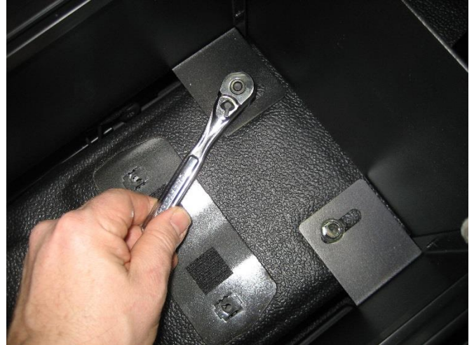
Use 1/4 x 3/4 self-threading screws (included in hardware kit) to loosely attach rear of console to existing floor inserts. Inserts located under rubber mat as shown. (7/16 socket)