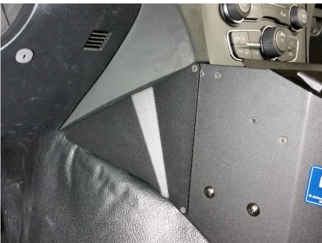
Attach driver side trim panel on with # 8 x 1/4 Flat head screws. (included with hardware kit)