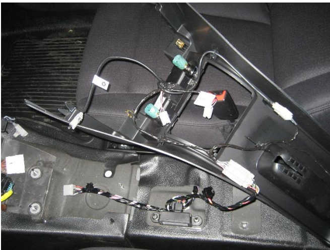
Remove O.E.M. plastic center console