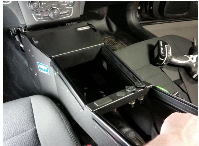
With the front printer trim panel installed, place the console tight to the dash. It is easiest to pick up the rear of the console and slide it towards the dash and then lower the rear.