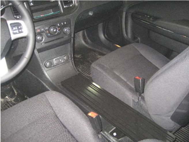
O.E.M. console prior to C-VS-0809-CHGR-2 console installation.