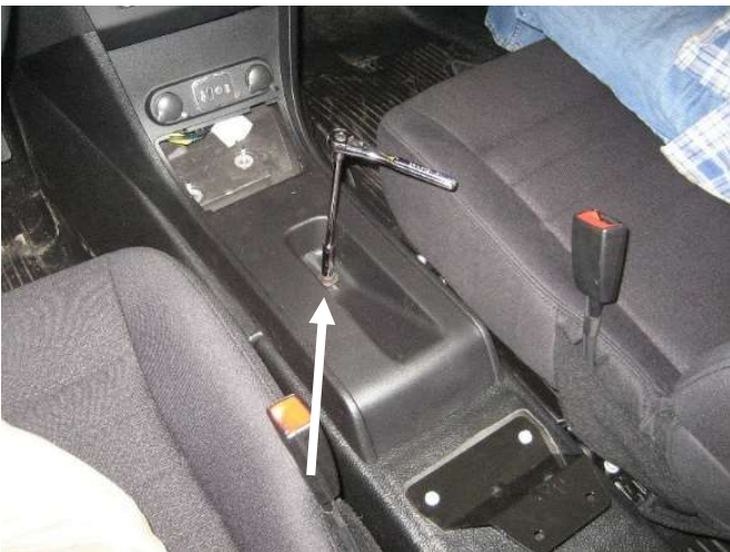
Remove bolts that hold underside of extrusion to rear floor bracket. (7/16 wrench) Remove rear floor bracket bolts and center console bolt. (10mm)