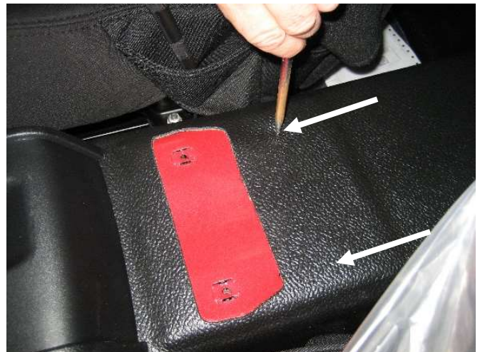
Locate inserts located under rubber mat as shown.