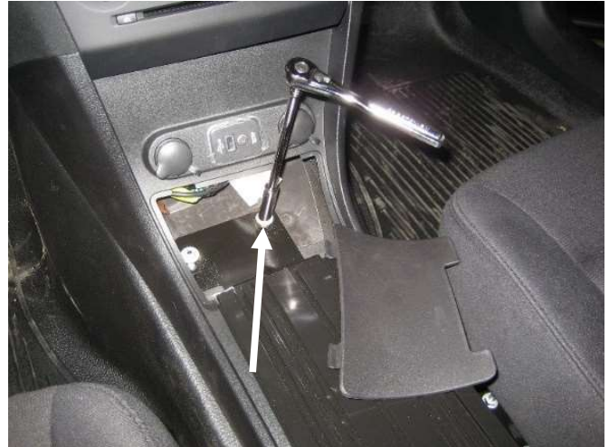
Remove forward O.E.M mini console plastic cover and remove two (2) nuts from front floor bracket. Nuts to be reused. (10mm)