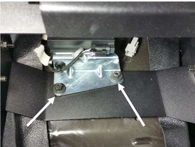
Sensor bracket will go on top of console, front floor bracket.