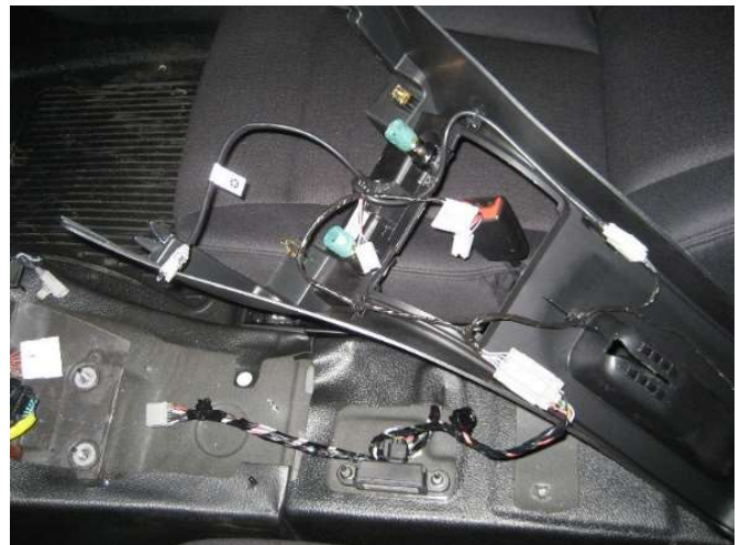
Remove O.E.M. plastic center console