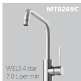
WELS 4 star 7.0 L per min