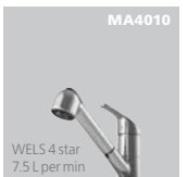
WELS 4 star 7.5 L per min