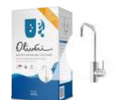
FS7075 Satellite filtration system