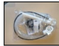
OVERFLOW or MULTIFILLER