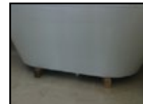
2 STRAIGHT PIECES TIMBER