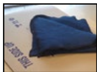
BATH PROTECTION (DROPSHEET/CARDBOARD/BLANKET)