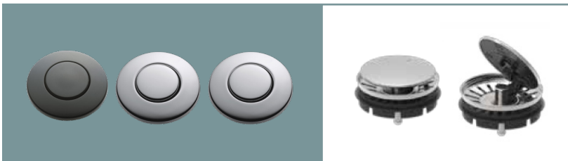
The air switch button is available in three colour choices.