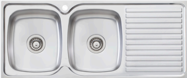
LEFT HAND BOWL