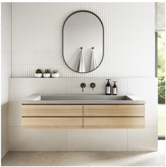
Above: Darbal Vanity 1500 x 500 x 40mm, mid grey, with centre bowl.

Pattern and colour may vary from those pictured. Each piece is unique and variation is a characteristic of concrete products.