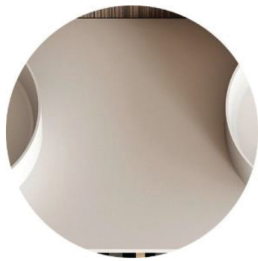
Sintered Stone Top