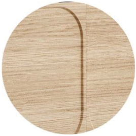
R90 Curved Shaker