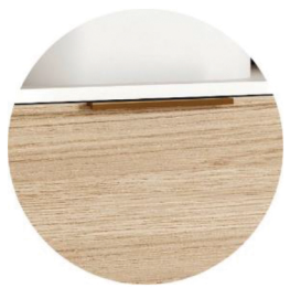
Top Pull Handle Options