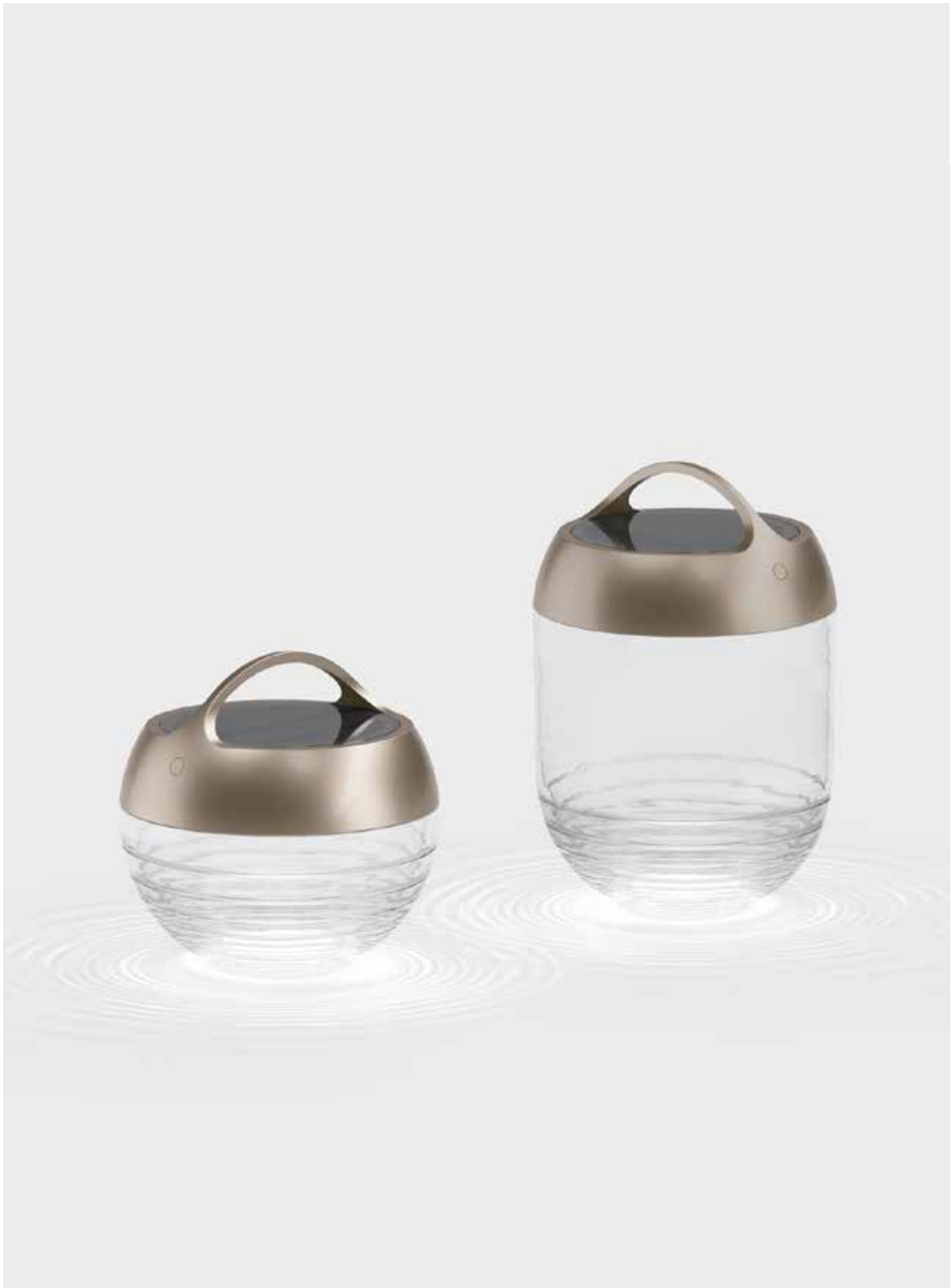
aqu Design: Klaus Nolting