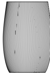
VASE 28 CM H 28 x L 16 x D 11 cm Available only in Blue color