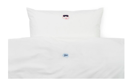
BED LINEN DEEP SLEEP Duvet L 200 \times D 200 cm / L 220 \times D 200 cm 2 Pillows L 60 \times D 63 cm Available only in White color