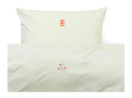
BED LINEN FEEL BETTER Duvet L 200 \times D 200 cm / L 220 \times D 200 cm 2 Pillows L 60 \times D 63 cm Available only in Sunwashed Green color