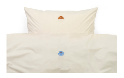
BED LINEN LAZY MORNING Duvet L 200 \times D 200 cm / L 220 \times D 200 cm 2 Pillows L 60 \times D 63 cm Available only in Warm Grey color