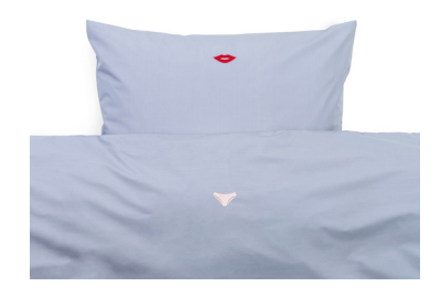
BED LINEN SASSY CHIC Duvet L 200 \times D 200 cm / L 220 \times D 200 cm 2 Pillows L 60 \times D 63 cm Available only in Lilac color