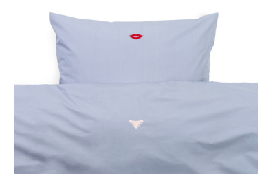
BED LINEN SASSY CHIC Duvet L 200 \times D 140 cm / L 220 \times D 140 cm Pillow L 60 \times D 63 cm Available only in Lilac color