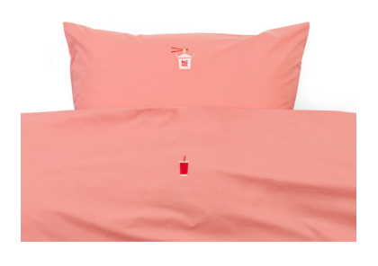
BED LINEN HAPPY HANGOVER Duvet L 200 \times D 200 cm / L 220 \times D 200 cm 2 Pillows L 60 \times D 63 cm Available only in Coral color