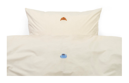
BED LINEN LAZY MORNING Duvet L 200 \times D 140 cm / L 220 \times D 140 cm Pillow L 60 \times D 63 cm Available only in Warm Grey color