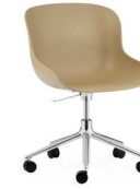
Hyg chair swivel 5W gaslift H: 70/83 x L: 72 x D: 72,5 x SH: 37/50 cm