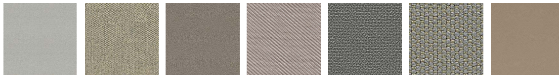
Camira Synergy Camira Main Line Flax Camira Aquarius Camira Oceanic Camira Yoredale Camira Zap Sørensen Leather Ultra