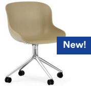
Hyg chair swivel 4W H: 84 x L: 54 x D: 55,5 x SH: 46 cm