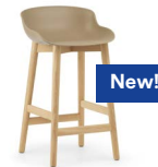
Hyg bar stool 65 cm wood H: 84 x L: 46,5 x D: 44 x SH: 65 cm