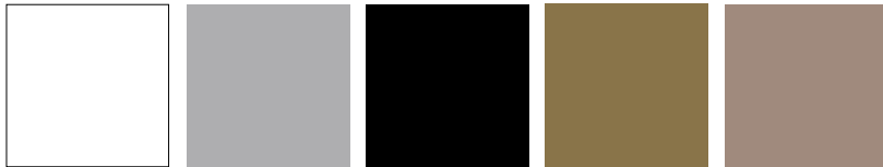
White Grey Black Olive Sand