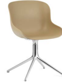
Hyg chair swivel 4L H: 84 x L: 54 x D: 55,5 x SH: 46 cm