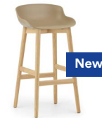
Hyg bar stool 75 cm wood H: 94 x L: 46,5 x D: 46,5 x SH: 75 cm