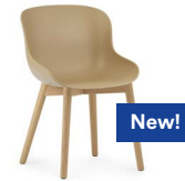
Hyg chair wood H: 84 x L: 54 x D: 53,5 x SH: 46 cm