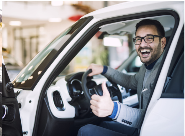
STEP 4 Refit the plastic engine cover Installation complete. Test Drive Time!