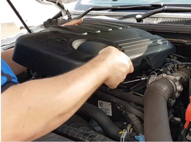
STEP 1 Open the bonnet Remove the plastic engine cover