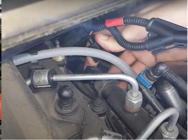
STEP 2 Locate the Fuel Rail Sensor based on your instructions Unhook it and connect the original style plugs to those of the Power Module