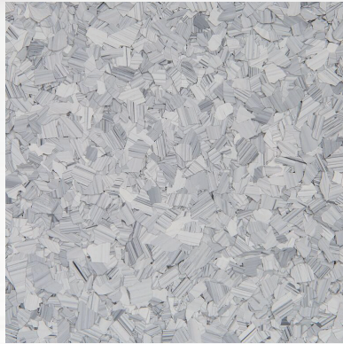
SCHIST STONE 1/4" 1/8"