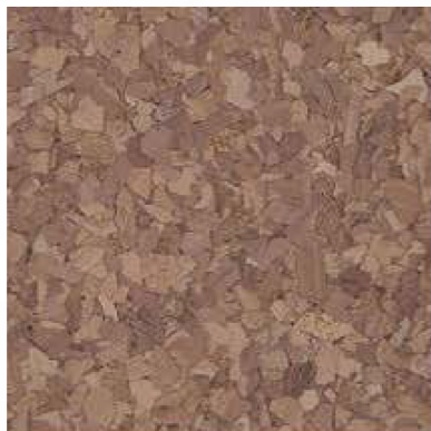
FELDSPAR 1/4" 1/8"