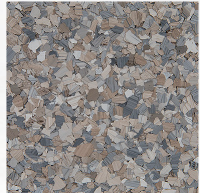
DOLERITE STONE 1/4" 1/8"