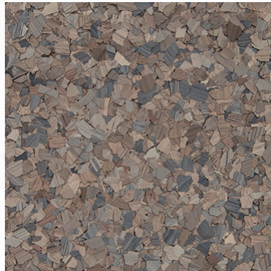
GARNET STONE 1/4" 1/8"