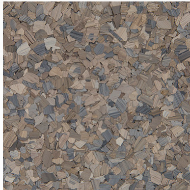
OBSIDIAN STONE 1/4" 1/8"