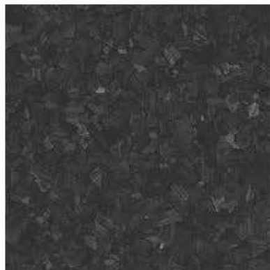
CARBON 1/4" 1/8"