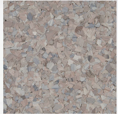
PUMICE STONE 1/4" 1/8"