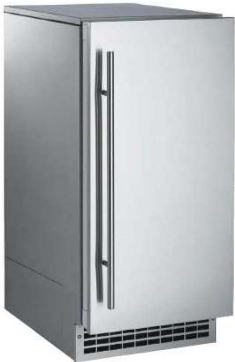
model shown is SCN60PA-15S