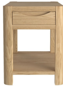
Lamp Table W50 X D60 x H60