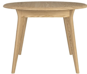
Compact Round Dining Table W105/140 x H75