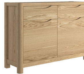
2 Door Sideboard W110 x D50 x H80