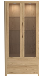
Tall Display Cabinet W90 x D40 x H109

Highclere Business Park, Inverurie, Aberdeenshire AB51 5QW