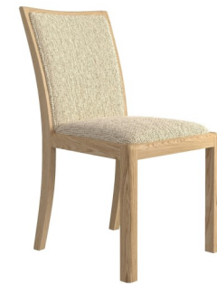
Low Dining Chair in Natural Fabric W50 x D56 x H90