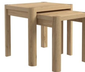
Nest of Tables W55 x D46 x H53