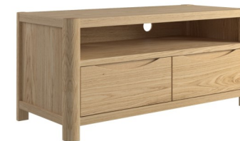
TV Unit 2 Drawers W110 x D50 x H50

Highclere Business Park, Inverurie, Aberdeenshire AB51 5QW