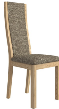
High Back Dining Chair in Grey W44 x D53 x H107