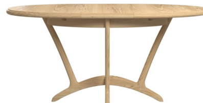
Oval Extending Dining Table W160/210 x D100 x H75