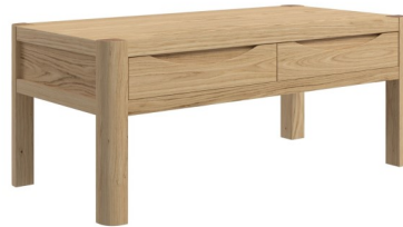
Compact Coffee Table W100 x D50 x H42