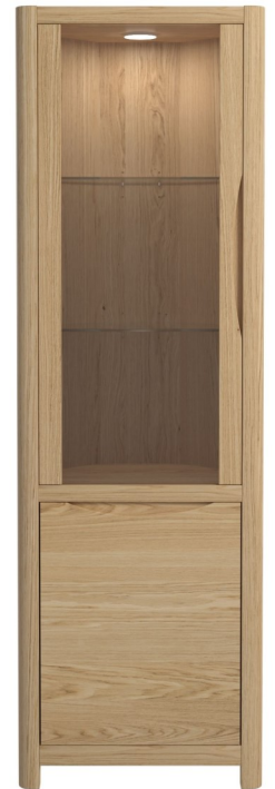
Corner Display Cabinet W60 x D43 x H109