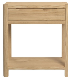
Hall Table W70 x D40 x H77