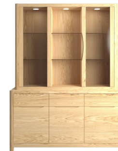
Display Top for 3 Door Side Board W139 x D40 x H115