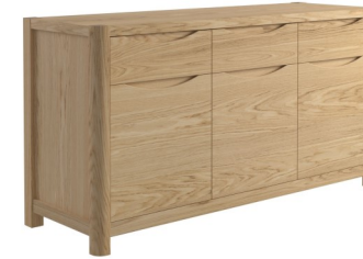
3 Door sideboard W150 x D50 x H80