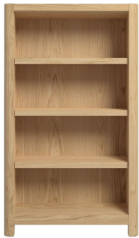
Bookcase W70 x D30 x H120