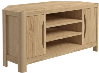
Corner TV Cabinet W104 x D50 x H51