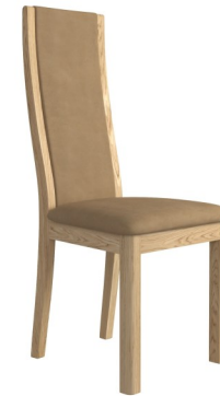
High Back Dining Chair in Faux Leather W44 x D53 x H107