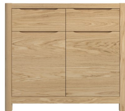
Compact Sideboard W90 x D38 x H80