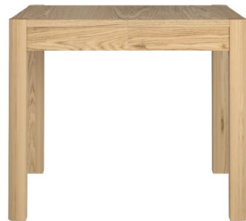
Small Rectangular Dining Table W90/130 x D90 x H75