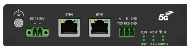
R5020L-A-5G-A25GL (PN: B098004)