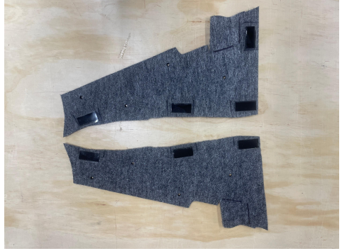
5 Seater only: Rear Driver side: