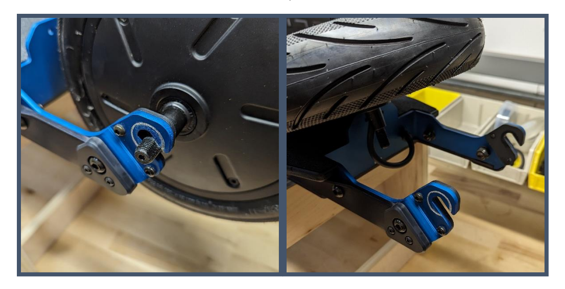
Step 4. Remove existing torque plates on each side and replace them with the new torque plates supplied with the rear fender. When installing these, it is recommended the screws be kept loose until the rear wheel is reinstalled.