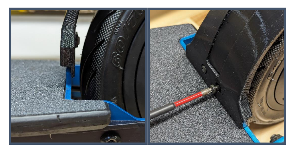
Step 10. Align the ends of the rear fender bracket to the outside of the torque plates as shown. Apply a small amount of thread locker to the ends of the two provided M4 x 6mm screws. Install the screws using the T20 Torx key. NOTE: Do not add any more thread locker than necessary. The proper amount shown is approximately the size of a sesame seed.