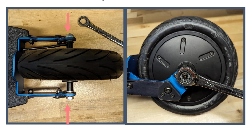
Step 2. Loosen the rear wheel axle nuts using the 18mm wrench.

Step 1. Make sure your 2Swift Skateboard is powered off.