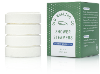
Spearmint & Eucalyptus STM012 With spearmint leaves. Very refreshing minty essential oil fragrance oil blend.