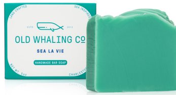
Sea La Vie BAR009 Sweet, clean, floral + citrus blend.