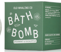
Spearmint & Eucalyptus BOM012 With spearmint leaves. Very refreshing minty essential oil fragrance oil blend.