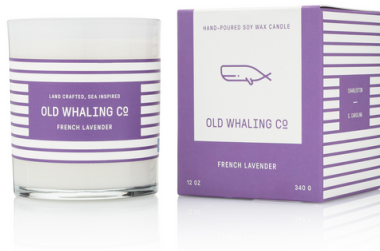
French Lavender CAN005 Perfect for lavender + floral lovers.