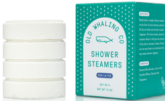
Sea La Vie STM009 Sweet, clean, floral + citrus blend.