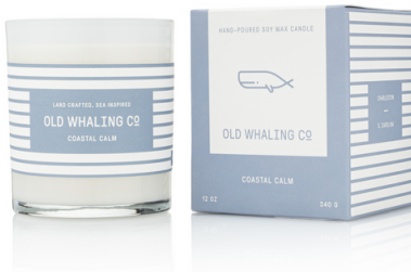
Coastal Calm CAN003 Relaxing, clean, neutral coastal blend of sea spray + soft florals + musk.