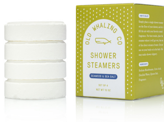
Seaweed & Sea Salt STM011 Beachy blend of sea salt, jasmine + mandarin.