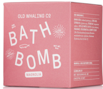
Magnolia BOM007 Rich floral blend reminiscent of the South.