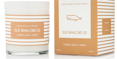
Oatmeal Milk & Honey CAN008 A warm blend of oatmeal, milk, honey and almond.