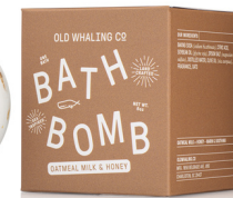
Oatmeal Milk & Honey BOM008 With oats. A warm blend of oatmeal, milk, honey and almond.