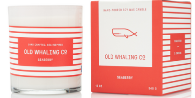
Seaberry CAN010 Warm berry + vanilla blend.