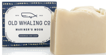
Mariner's Moon BAR015 Sweet woody scent of oud is enhanced with sandalwood, amber and ocean breeze