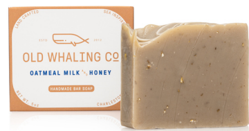
Oatmeal Milk & Honey BAR008 Made with oats, honey and goat's milk.