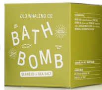
Seaweed & Sea Salt BOM011 With sea clay. Beachy blend of sea salt, jasmine + mandarin.