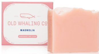
Magnolia BAR007 Rich floral blend reminiscent of the South.