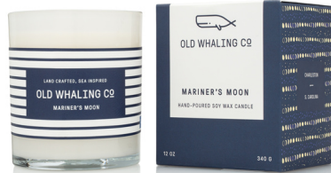
Mariner's Moon CAN015 Sweet woody scent of oud is enhanced with sandalwood, amber and ocean breeze