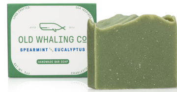
Spearmint & Eucalyptus BAR012 Made with spirulina + activated charcoal. Very refreshing minty essential oil fragrance oil blend.