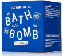
Oceanswept BOM006 Rich warm blend of sandalwood, lemon + vetiver.