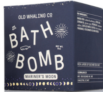
Mariner's Moon BOM015 Sweet woody scent of oud is enhanced with sandalwood, amber and ocean breeze