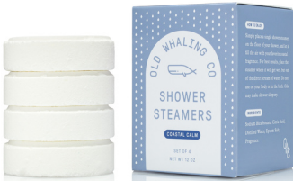
Coastal Calm STM003 Relaxing, clean, neutral coastal blend of sea spray + soft florals + musk.