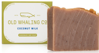
Coconut Milk BAR004 Made with luffa powder + shreds. Tropical, warm + creamy coconut scent.