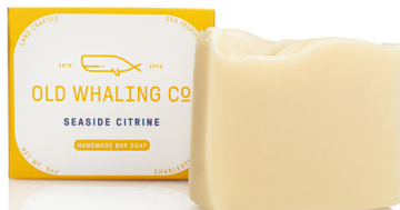
Seaside Citrine BAR016 A bright citrus scent with subtle hints of musk and amber.