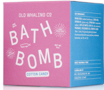
Cotton Candy BOM014 Sweet candy fragrance, reminiscent of the beach boardwalk.