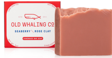
Seaberry & Rose Clay BAR010 Made with rose kaolin clay, great as a face bar. Warm berry + vanilla blend.