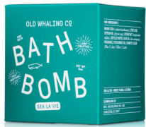
Sea La Vie BOM009 Sweet, clean, floral + citrus blend.