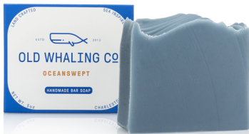
Oceanswept BAR006 Made with activated charcoal, indigo powder. Rich warm blend of sandalwood, lemon + vetiver.