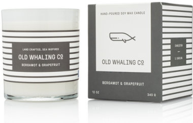
Bergamot & Grapefruit CAN002 Refreshing essential oil + fragrance oil blend of citrus.