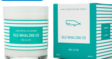
Sea La Vie CAN009 Sweet, clean, floral + citrus blend.