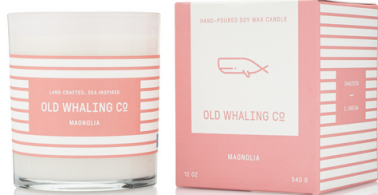
Magnolia CAN007 Rich floral blend reminiscent of the South.