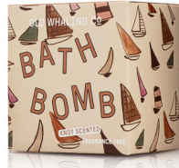
Knot Scented BOM013 Color- and scent-free, for a fun, fizzy experience for those with the most sensitive of skin.