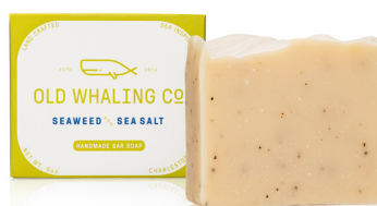
Seaweed & Sea Salt BAR011 Made with kelp powder, kelp granules. Beachy blend of sea salt, jasmine + mandarin.