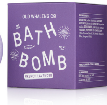
French Lavender BOM005 Perfect for lavender + floral lovers.