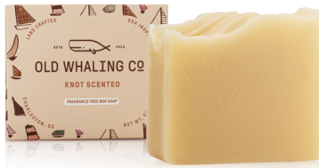
Knot Scented BAR013 Made with goats milk. Color + fragrance free.