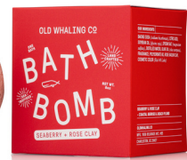
Seaberry & Rose Clay BOM010 With rose kaolin clay. Warm berry + vanilla blend.