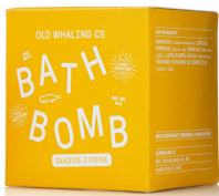
Seaside Citrine BOM016 A bright citrus scent with subtle hints of musk and amber.