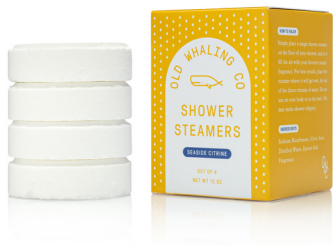
Seaside Citrine STM016 A bright citrus scent with subtle hints of musk and amber.