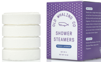
French Lavender STM005 Perfect for lavender + floral lovers.