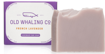
French Lavender BAR005 Perfect for lavender + floral lovers.