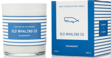
Oceanswept CAN006 Rich warm blend of sandalwood, lemon + vetiver.