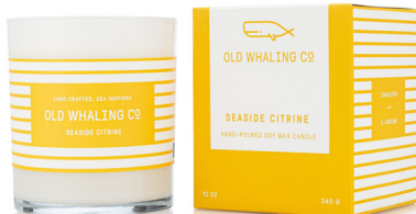
Seaside Citrine CAN016 A bright citrus scent with subtle hints of musk and amber.