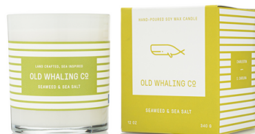
Seaweed & Sea Salt CAN011 Beachy blend of sea salt, jasmine + mandarin.