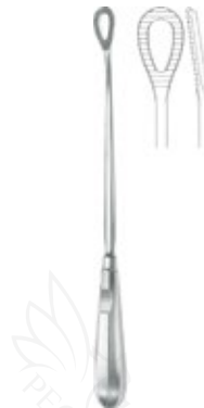
Obstetrics Ovum curette, acc. to Pestalozza

Other Sizes: 021-0382-01 : 17 mm, 30 cm 021-0382-02 : 20 mm, 30 cm 021-0382-03 : 23 mm, 30 cm