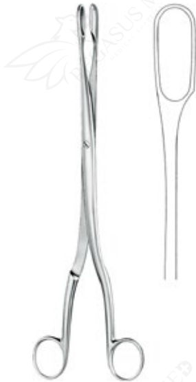
Obstetrics Ovum forceps, acc. to Winter, straight, N. 1