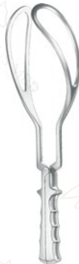
Obstetrics Obstetrical forceps, acc. to Simpson