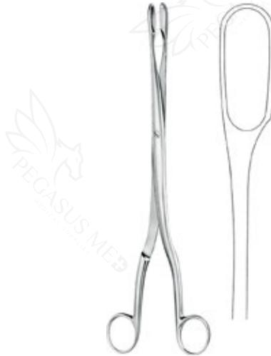
Obstetrics Ovum forceps, acc. to Winter, straight, N. 2