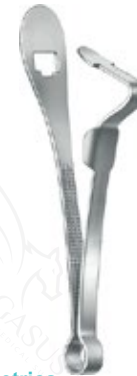
Obstetrics Umbilical cord clamp, acc. to Collin