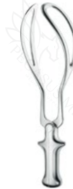
Obstetrics Obstetrical forceps, acc. to Simpson

Other Sizes: 021-0141-36 : 35 cm 021-0141-40 : 40.5 cm