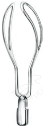
Obstetrics Obstetrical forceps, acc. to Wrigley