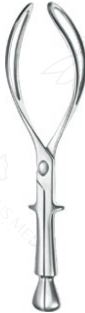
Obstetrics Obstetrical forceps, acc. to Naegele