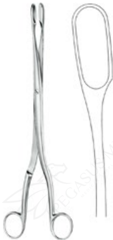
Obstetrics Ovum forceps, acc. to Winter, curved, N. 2