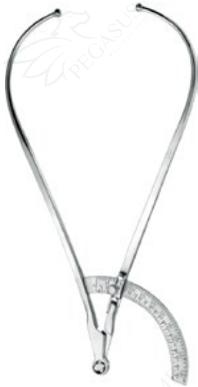
Obstetrics Pelvimeter, acc. to Martin, inches and cm