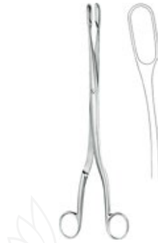
Obstetrics Ovum forceps, acc. to Winter, curved, N. 1