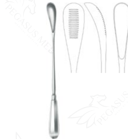
Obstetrics Ovum curette, acc. to Cuzzi