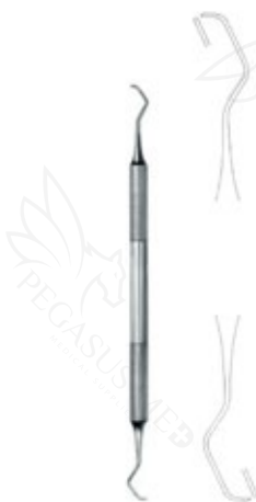
Dental and Oral Surgery Columbia, universal explorer