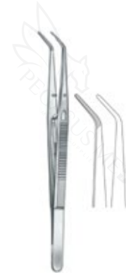
Dental and Oral Surgery London-College, cotton pliers, with lock