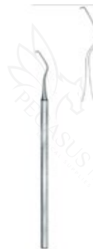
Dental and Oral Surgery explorer