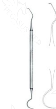
Dental and Oral Surgery explorer, octagonal handle