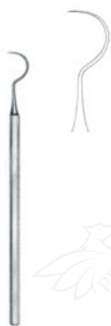
Dental and Oral Surgery explorer