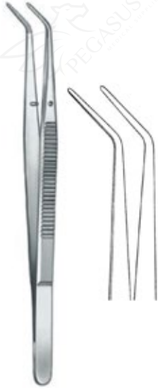
Dental and Oral Surgery London-College, cotton pliers, smooth