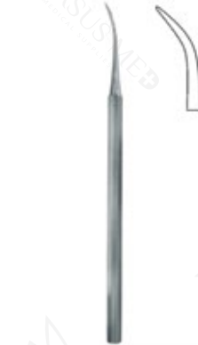
Dental and Oral Surgery Gilmore, heavy pattern probe