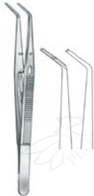
Dental and Oral Surgery London-College, cotton pliers, for silver points