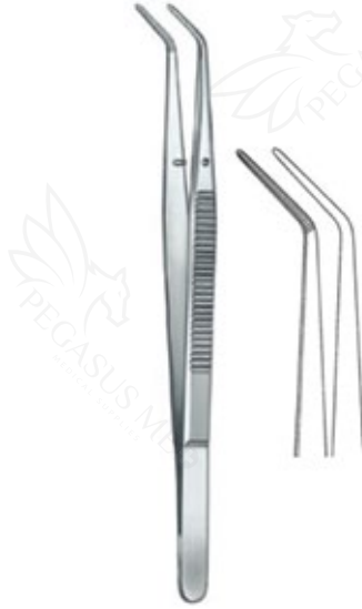
Dental and Oral Surgery London-College, cotton pliers