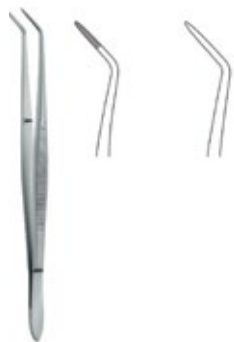
Dental and Oral Surgery Meriam, cotton pliers