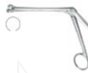
Tonsillectomy Tonsil forceps, acc. to Hartmann