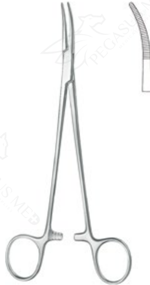
Tonsillectomy Tonsil forceps, acc. to Schnidt, curved