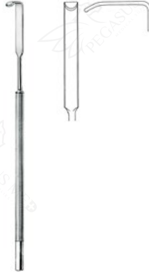
Tonsillectomy Cleft palate retractor, long