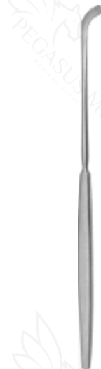
Tonsillectomy Tonsil knife, acc. to Fisher