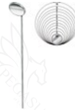
Tonsillectomy Laryngeal mirror, Rhodium, without Handle

Material: all other, not specially marked material types