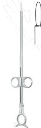
Tonsillectomy Tonsil snare, acc. to Eve, without ratchet