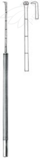
Tonsillectomy Elevator acc. to Salyer, angled, graduated