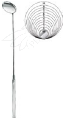
Tonsillectomy Laryngeal mirror, Rhodium, with Handle

Material: all other, not specially marked material types