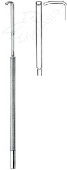
Tonsillectomy Cleft palate retractor, short