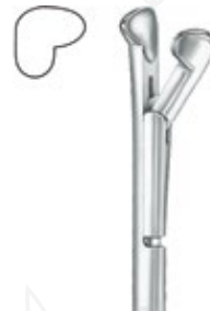
Tonsillectomy Tip for laryngeal forceps, acc. to Scheinmann, curved sideways