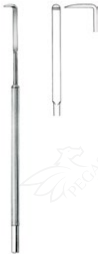
Tonsillectomy Dissector, acc. to Salyer, angled, long