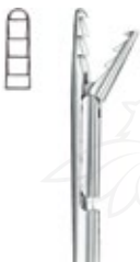
Tonsillectomy Tip for laryngeal forceps, acc. to Seiffert, coarse