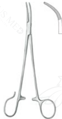
Tonsillectomy Tonsil forceps, acc. to Schnidt, curved