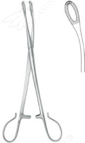
Tonsillectomy Tonsil grasping forceps, acc. to Blohmke 1 x 2 teeth