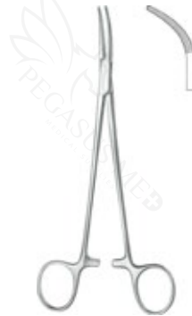
Tonsillectomy Tonsil forceps, acc. to Schnidt, curved