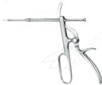
Tonsillectomy Tonsil snare, acc. to Tyding, with 1 TIP