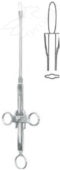
Tonsillectomy Tonsil snare, acc. to Bruenings