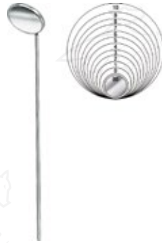
Tonsillectomy Laryngeal mirror, without Handle

Material: all other, not specially marked material types