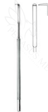
Tonsillectomy Dissector, acc. to Salyer, angled, short