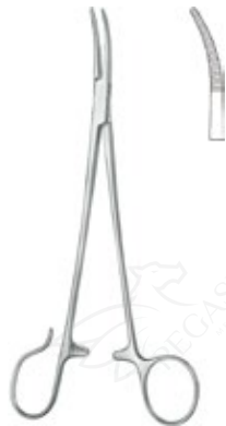
Tonsillectomy Tonsil forceps, acc. to Schnidt, curved