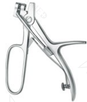
Tonsillectomy Universal Handle for laryngeal forceps, acc. to Huber

Other Sizes: 026-0541-13 : Ø 13 mm, 12 cm 026-0541-15 : Ø 15 mm, 12 cm