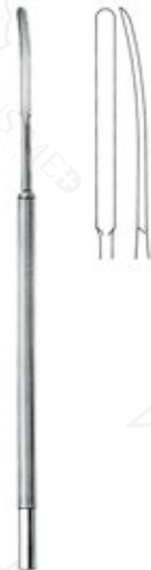
Tonsillectomy Elevator acc. to Salyer, slightly curved