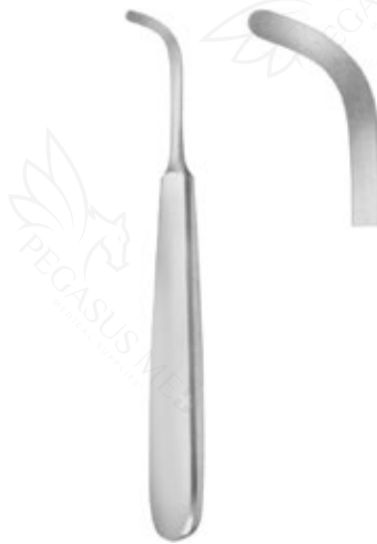
Tonsillectomy Palatal raspatory, curved left