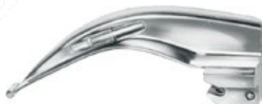
Anaesthesia Laryngoscope blade, acc. to McIntosh, no. 2 ----- Material: Stainless steel ----- Other Sizes: 010-0383-02 : 90 mm