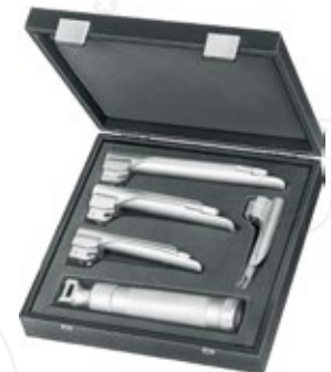
Anaesthesia Laryngoscope set, acc. to Foregger