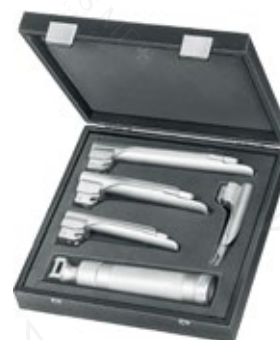
Anaesthesia Storage case, for 3 curved laryngoscope blades

Material: all other, not specially marked arial types