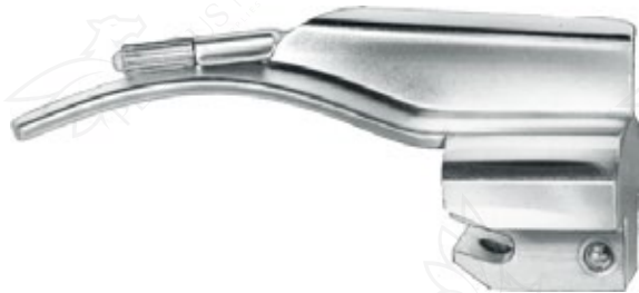
Anaesthesia Laryngoscope blade, acc. to McIntosh, no. 0 ----- Material: Stainless steel ----- Other Sizes: 010-0383-00 : 55 mm