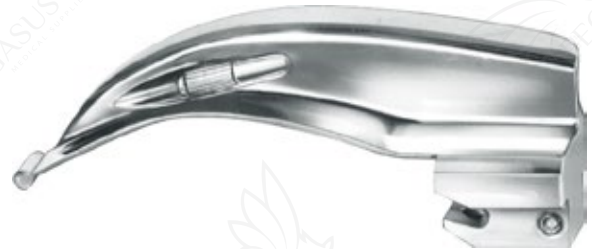
Anaesthesia Laryngoscope blade, acc. to McIntosh, no. 1 ----- Material: Stainless steel ----- Other Sizes: 010-0383-01 : 75 mm