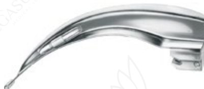
Anaesthesia Laryngoscope blade, acc. to McIntosh, no. 4 ----- Material: Stainless steel ----- Other Sizes: 010-0383-04 : 135 mm