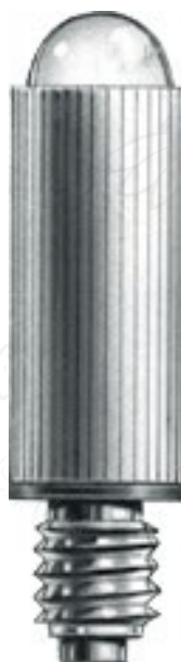
Anaesthesia Spare bulb, large