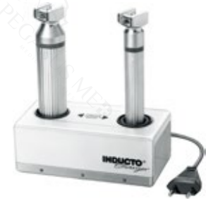
Anaesthesia Inductive Charger unit, for laryngoscopes

Material: all other, not specially marked material types