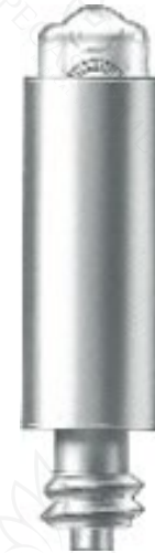
Anaesthesia Xenon bulb, 2.5 V

Material: all other, not specially marked material types