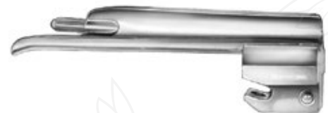
Anaesthesia Laryngoscope blade acc. to Foregger, no. 1 ----- Material: Stainless steel ----- Other Sizes: 010-0387-01 : 70 mm