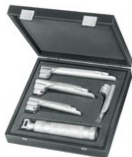
Anaesthesia Storage case, for 3 straight laryngoscope blades

Material: all other, not specially marked arial types