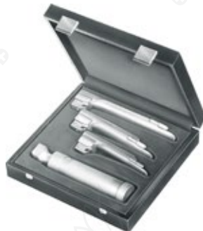
Anaesthesia Laryngoscope set, acc. to Foregger