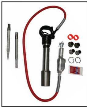
Sold as shown