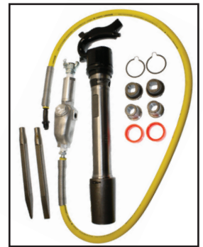
Sold as shown