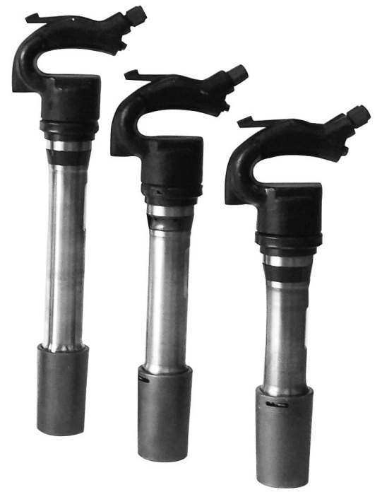
TX-133-6RB-OT TX-133-8RB-OT TX-133-11RB-OT