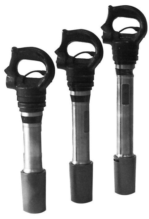
TX-133-6RB TX-133-8RB TX-133-11RB