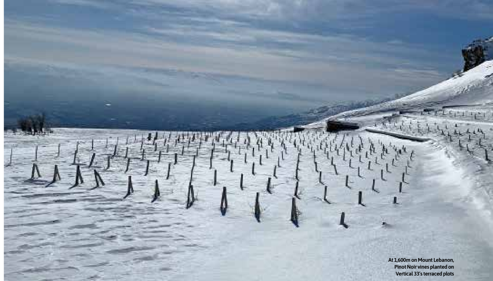
At 1,600m on Mount Lebanon, Pinot Noir vines planted on Vertical 33's terraced plots

Azar is one of several new producers from the diaspora on a quest to rediscover Lebanon's viticultural heritage. A doctor trained in the US and specialising in infectious disease, Azar