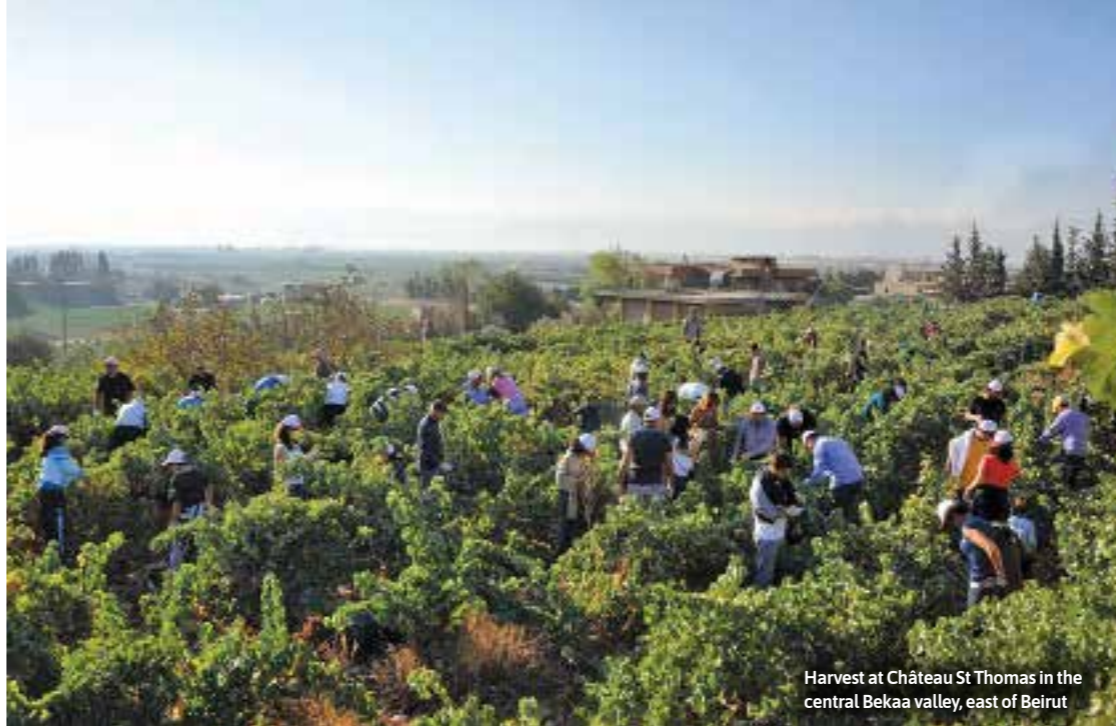
Harvest at Château St Thomas in the central Bekaa valley, east of Beirut