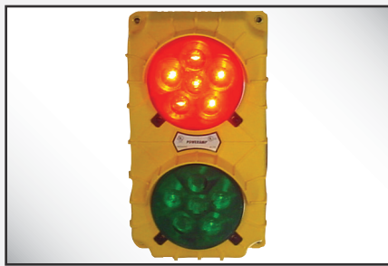
Exterior Lights - Incandescent standard with optional LED for longer life.