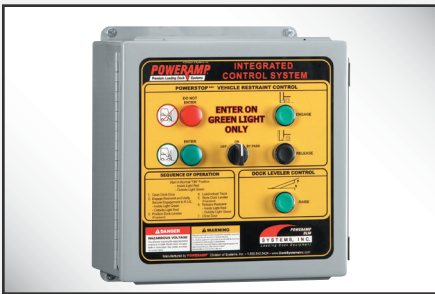
Dock Alert Communication System Control panel for automatic lights - manual light control panel similar.