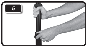
STEP 5 Loosen Z knob on the telescoping collar and raise center tube 6-10". Retighten Z knob.