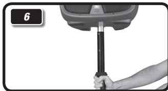
STEP 6 Put speaker cabinet on top, slowly loosen Z knob and raise cabinet to desired height. Tighten Z knob. NOTE: Stand load capacity is 150 lbs. (68.2 lbs.)

To lower speaker, slowly loosen hand knob. Use caution.