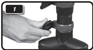
STEP 1 Loosen leg fitting "Z" knob.