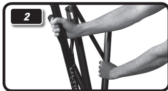
STEP 2 Turn stand upside down and pivot legs so Ultimate Support label faces you.