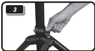
STEP 3 Turn stand upright and slide leg fitting to adjust diameter of leg spread. Leg braces should be parallel to floor for maximum stability. Tighten Z knob.