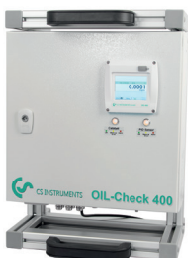
Handle and stand