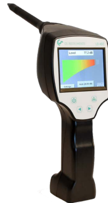
LD 450 with straightening tube and straightening tip for accurate detection.