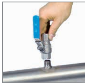
A Screw neck

By means of the drilling jig, it is possible to drill under pressure through the 1/2" ball valve into the existing pipe. The drilling chips are collected in a filter. Then install the probe as described under 1).