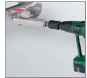
Drill under pressure with the CS drilling jig

3) Due to the large measuring range of the probe even extreme requirements to the consumption measurement (high volume flow in small pipe diameters) can be met.