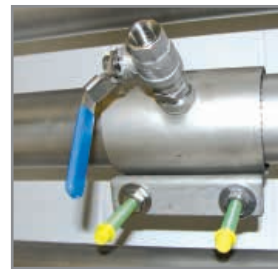
B Spot drilling collars