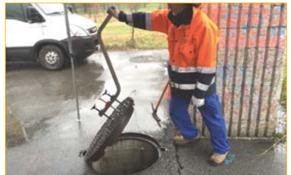
Very robust, resistant to rust and over usage.