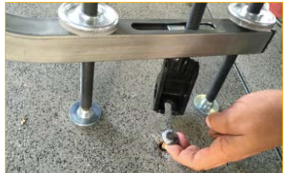
Central tie rod with rotating and sliding hook. In central picture visible female coupling.