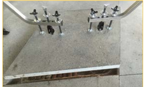
Adjustable side strut to ensure support for any surface.