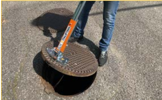
Use 1: manual Opening.

Universal magnetic lifter with curved base to ensure the best magnetic adhesion on the circumference of circular manhole covers also with "filling" cast iron frame and in asphalt / stone / cement with central metal disc.