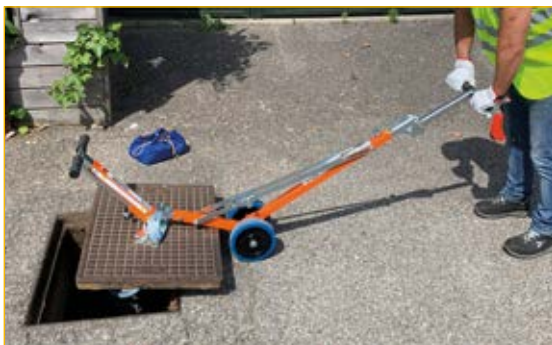
Use 2: opening with wheeled lever APS90 or APS80.