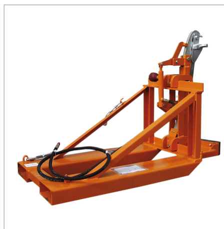
RS-I/91 with hydraulic grip lock