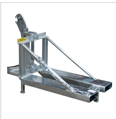
RS-I/M with supporting feet for straddle stackers