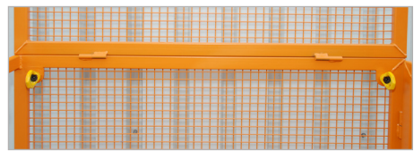
PPE anchor points (personal protective equipment)