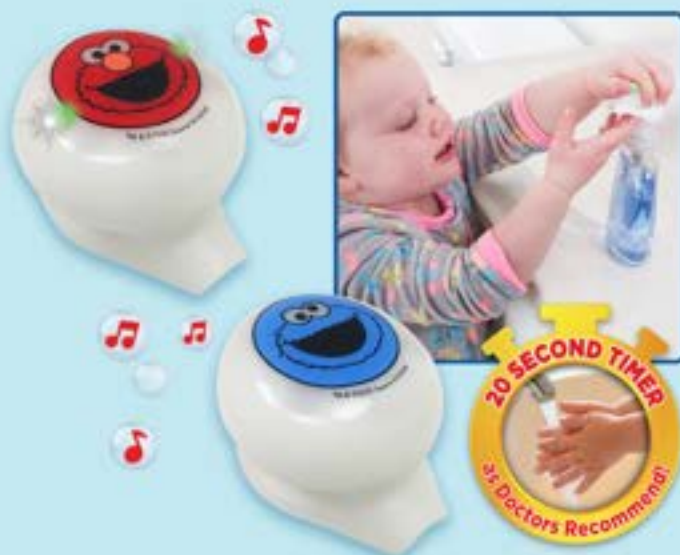
Musical Hand Washing Soap Pump Timers

Call 800-257-7844 to find a retailer near you!