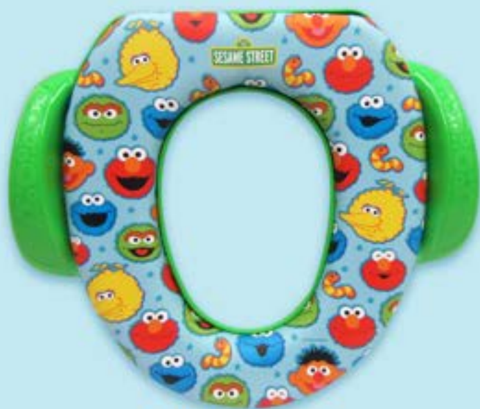
Soft Potty Seats