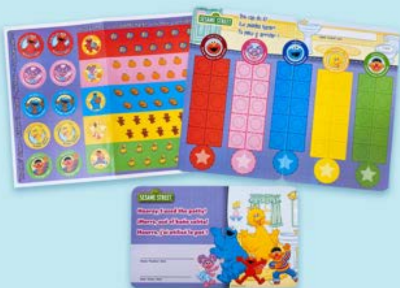
Potty Training Reward Kits