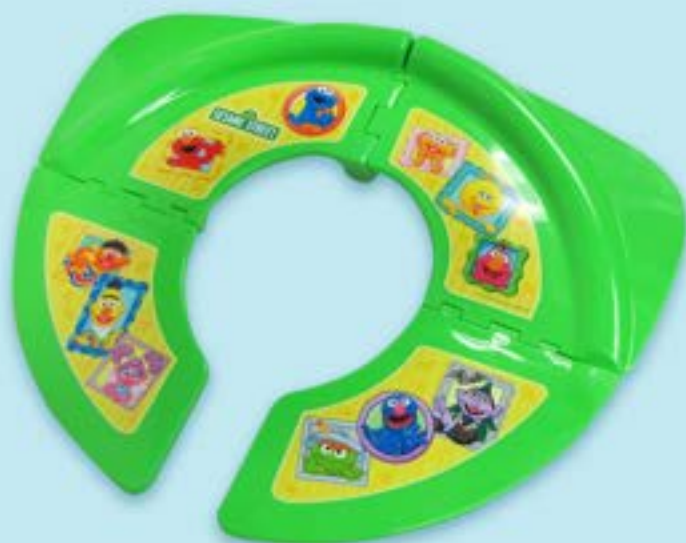
Folding Travel Potty Seats