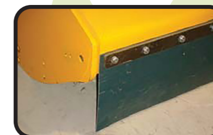
▶ Rear gums