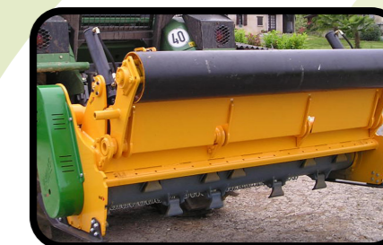
▶ Hydraulic rear roller