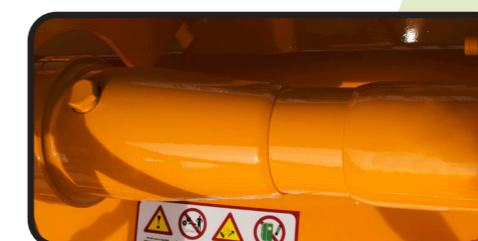
▶ Freewheel on sleeve